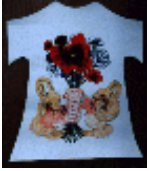
fifth place winner - Watkins Mill High School, Gaithersburg, Md.