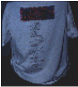
first place winner - Fort Hill High School, Cumberland, Md.