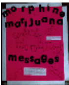
fourth place winner - Bel Air High School, Bel Air, Md.