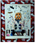
fourth place winner - Springbrook High School, Silver Spring, Md.