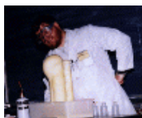
foam from hydrogen peroxide decomposition