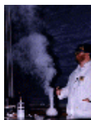
genie in a bottle