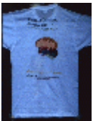
fifth place winner - Boonsboro High School, Boonsboro, Md.