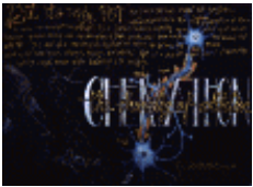
second place winner - Gaithersburg High School, Gaithersburg, Md.